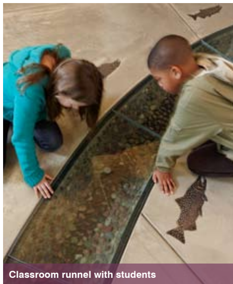
Classroom runnel with students

Despite Seattle's image as the land of plenty of rain, water conservation is a concern because summer months can typically be dry. Proponents say the Seattle school project and others like it recognize water as a precious resource. Treating waste and runoff onsite also means reducing the land, infrastructure, energy and chemicals needed to convey water to taps and later to treat what flows down toilets and bathtubs.