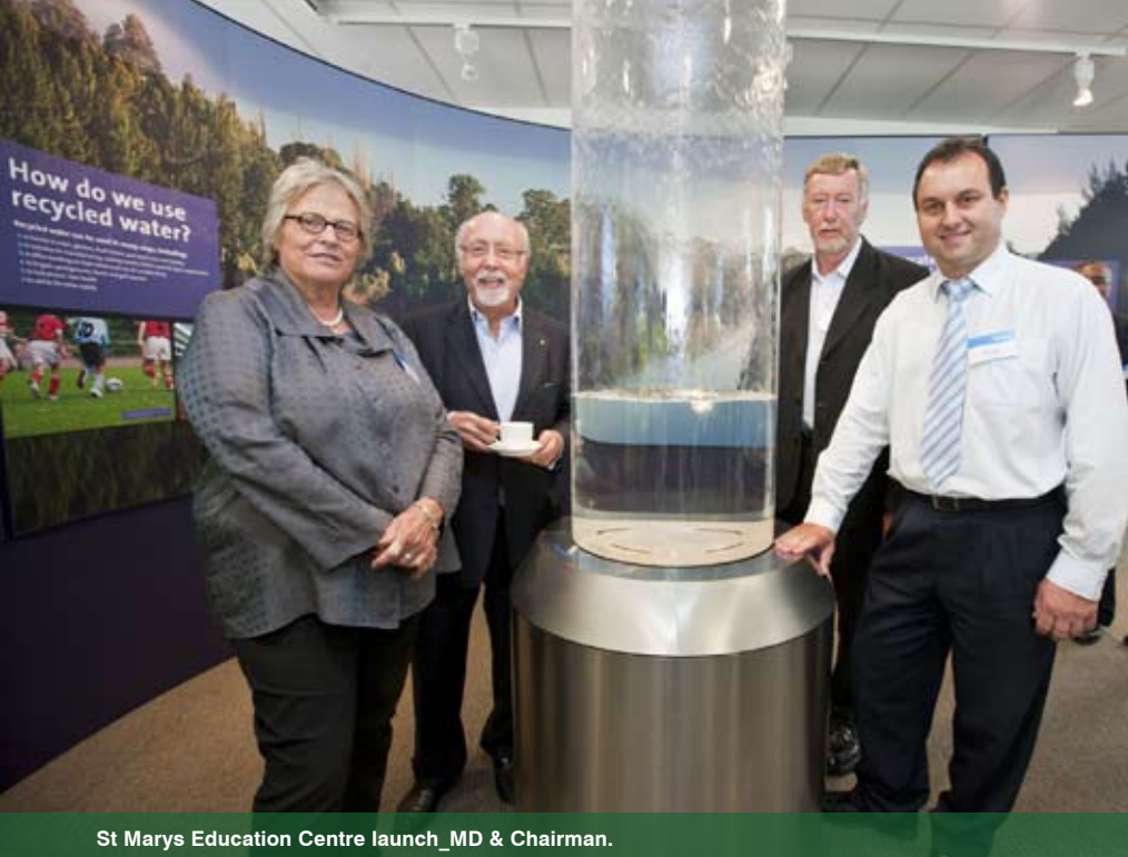
St Marys Education Centre launch_MD & Chairman.