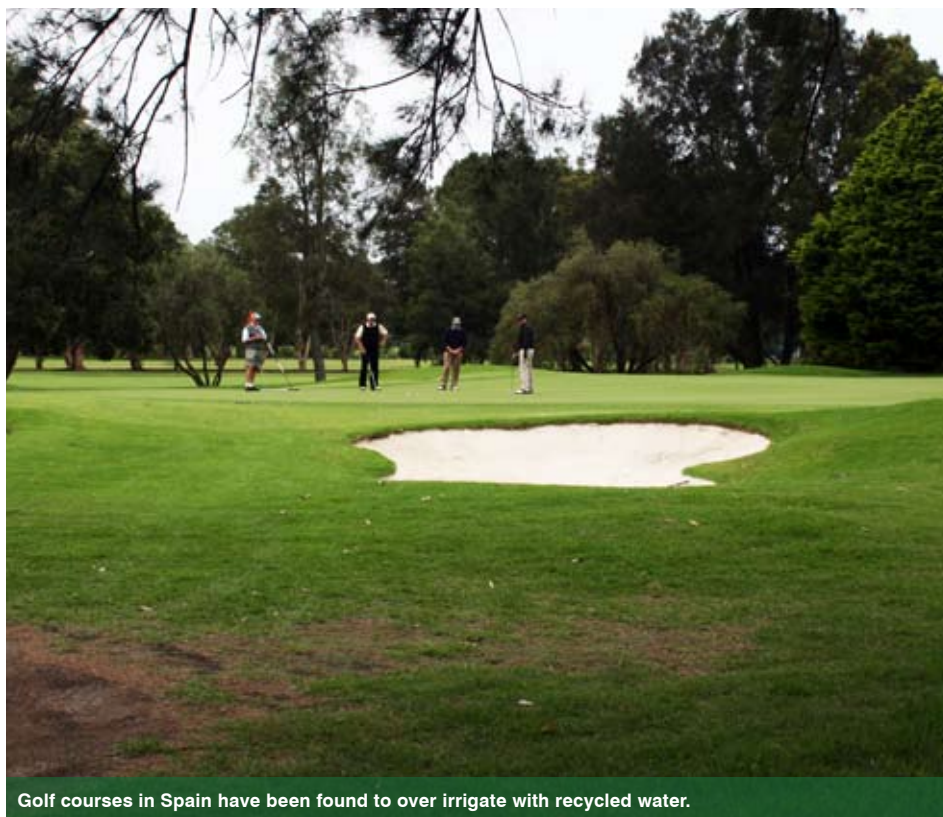
Golf courses in Spain have been found to over irrigate with recycled water.

In addition there may be the possible long-term effects of using it for cultivated plants, the irrigation system and the water of the aquifer. The scientists say it is not only the