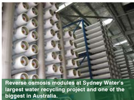
Reverse osmosis modules at Sydney Water's largest water recycling project and one of the biggest in Australia.

"The centre is designed for universities, TAFE colleges and high schools, professional and trade groups, and key community groups. Sydney Water is working with secondary and tertiary teachers to ensure that the material at the centre targets and complements existing courses."