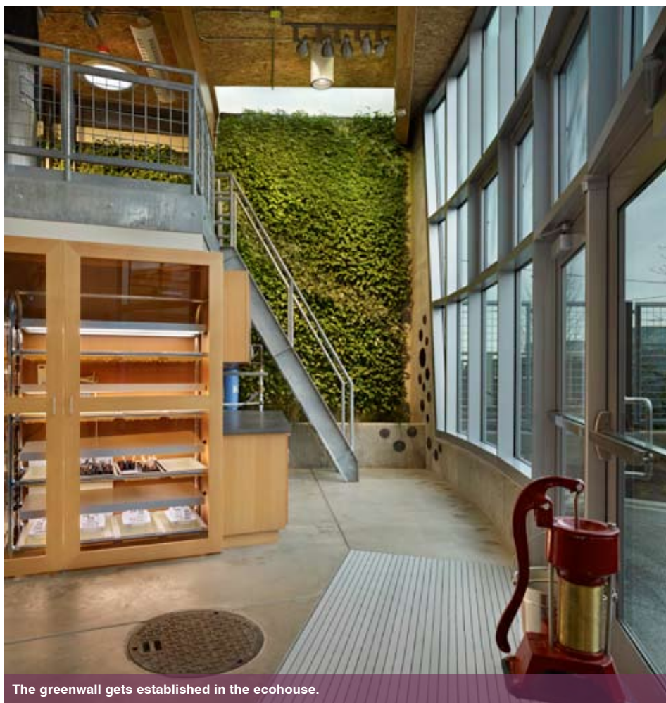
The greenwall gets established in the ecohouse.

Designed to be self-sustaining in the energy, water and waste use, the school's new science building is made up of a classroom, the ecohouse and toilet facilities. The new