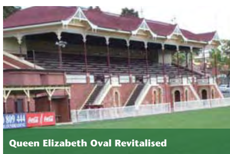
Queen Elizabeth Oval Revitalised