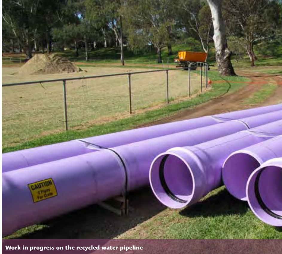
Work in progress on the recycled water pipeline

Adelaide parklands to benefit from high quality recycled water piped from Glenelg.