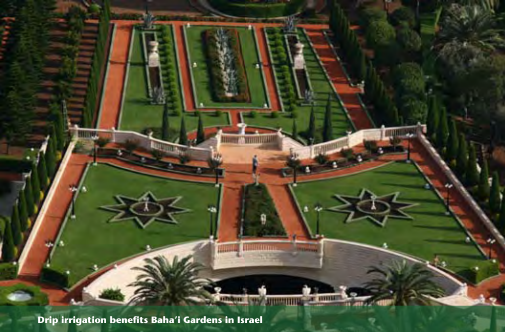
Drip irrigation benefits Baha'i Gardens in Israel