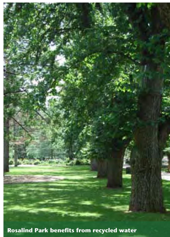
Rosalind Park benefits from recycled water