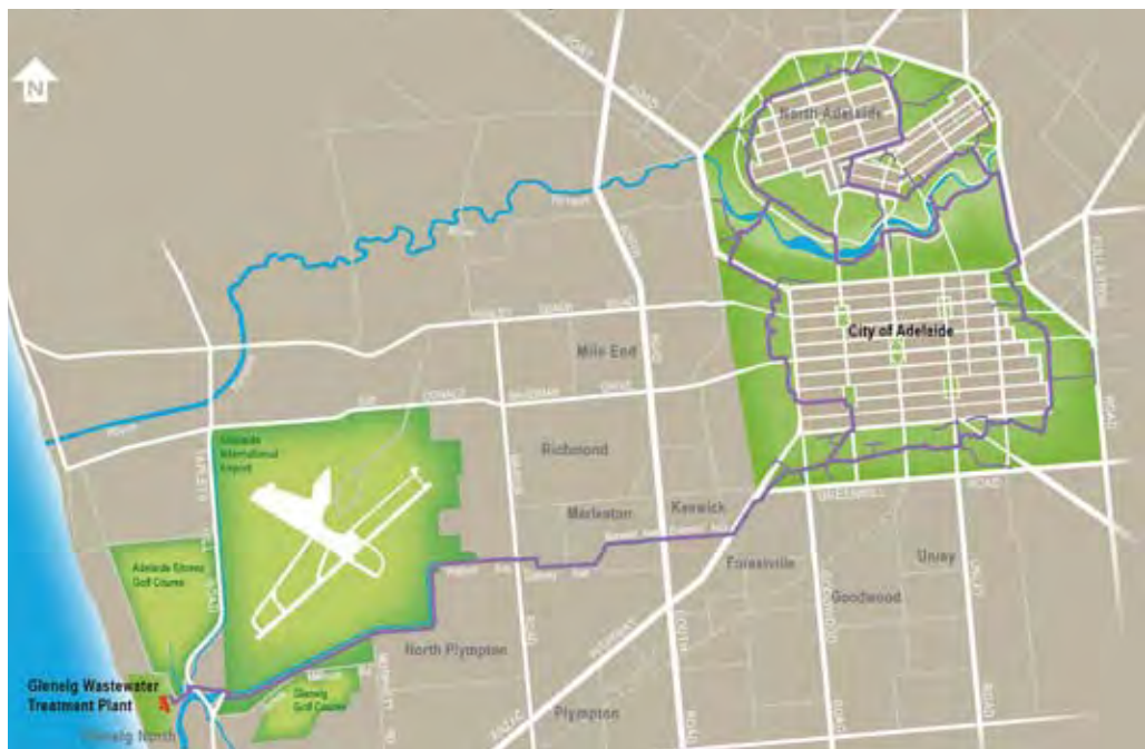
Glenelg to Adelaide Park Lands Recycled Water Project