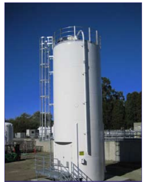
Wastewater Solutions' patented Aqua-Ject® Gypsum injection system, installed at the Carmel Area Wastewater District treatment facility- Carmel, California.