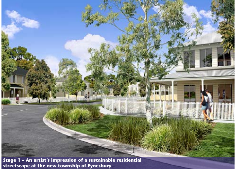
Stage 1 – An artist's impression of a sustainable residential streetscape at the new township of Eynesbury

Edited and designed by Arris Pty Ltd ACN: 9109 2739 574 Phone: (08) 8303 6706 www.arris.com.au