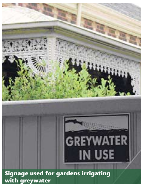
Signage used for gardens irrigating with greywater

plumbing practitioners; local government health and environment officers; plumbing regulators; manufacturers of greywater and stormwater products; and households.